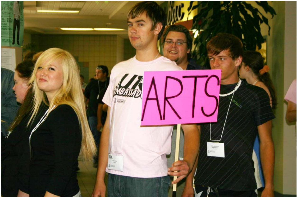
Several new Arts students at orientation last Thursday